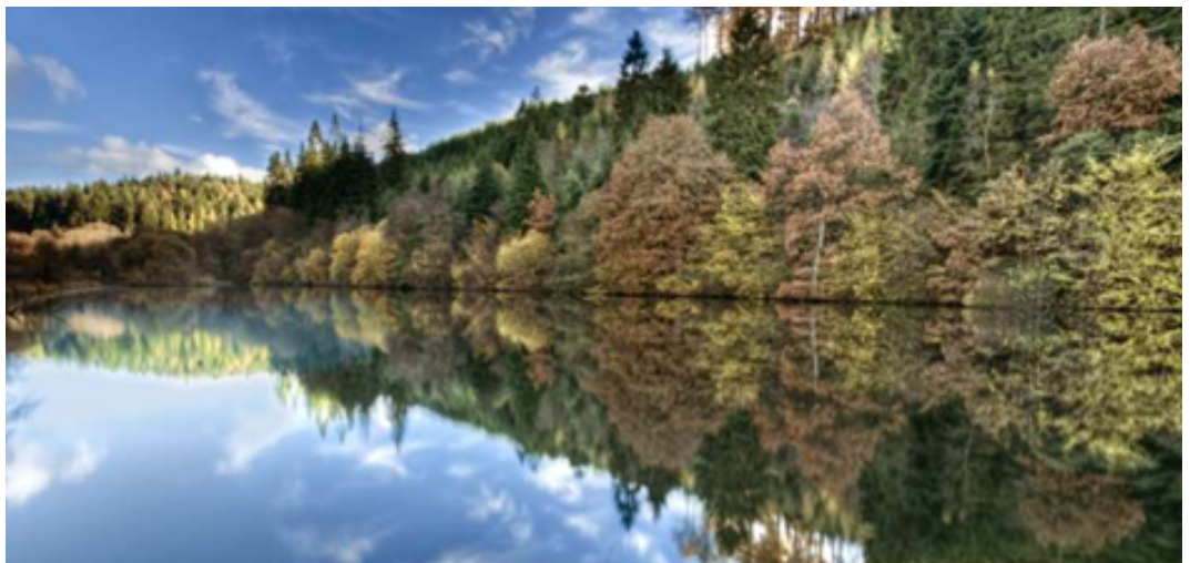
The Great Yorkshire Forest, Dalby